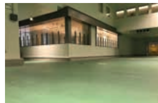
Tuna Auction Observation Deck

This is where domestic and foreign fisheries are gathered and traded. Here, the tuna auction is viewable from the visitor's deck.