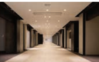
Market Related Restaurants