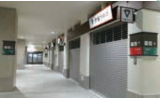
Market-Related Goods Shops