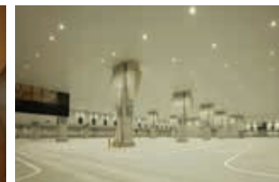
Fruit and Vegetables Wholesale Market (Viewable from the deck)